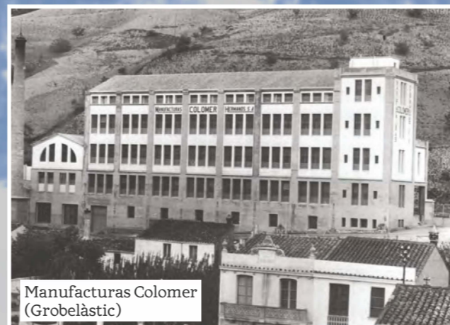
Manufacturas Colomer (Grobelàstic)