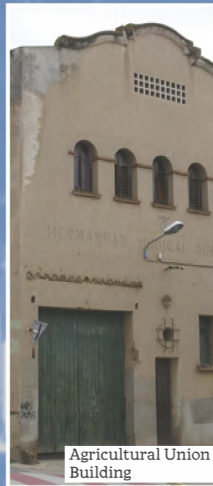
Agricultural Union Building